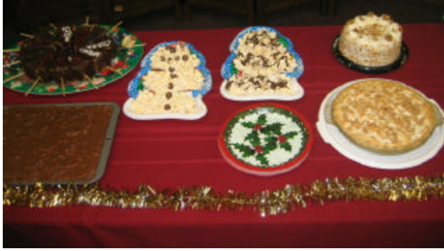
The dessert table was groaning with delectable goodies. Winning cake partially pictured at lower left.