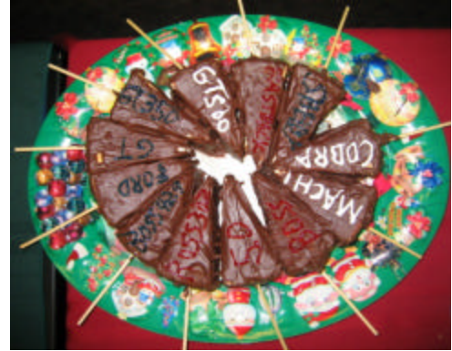
Cream cheese dipped in chocolate on a stick, with Mustang-themed lettering.